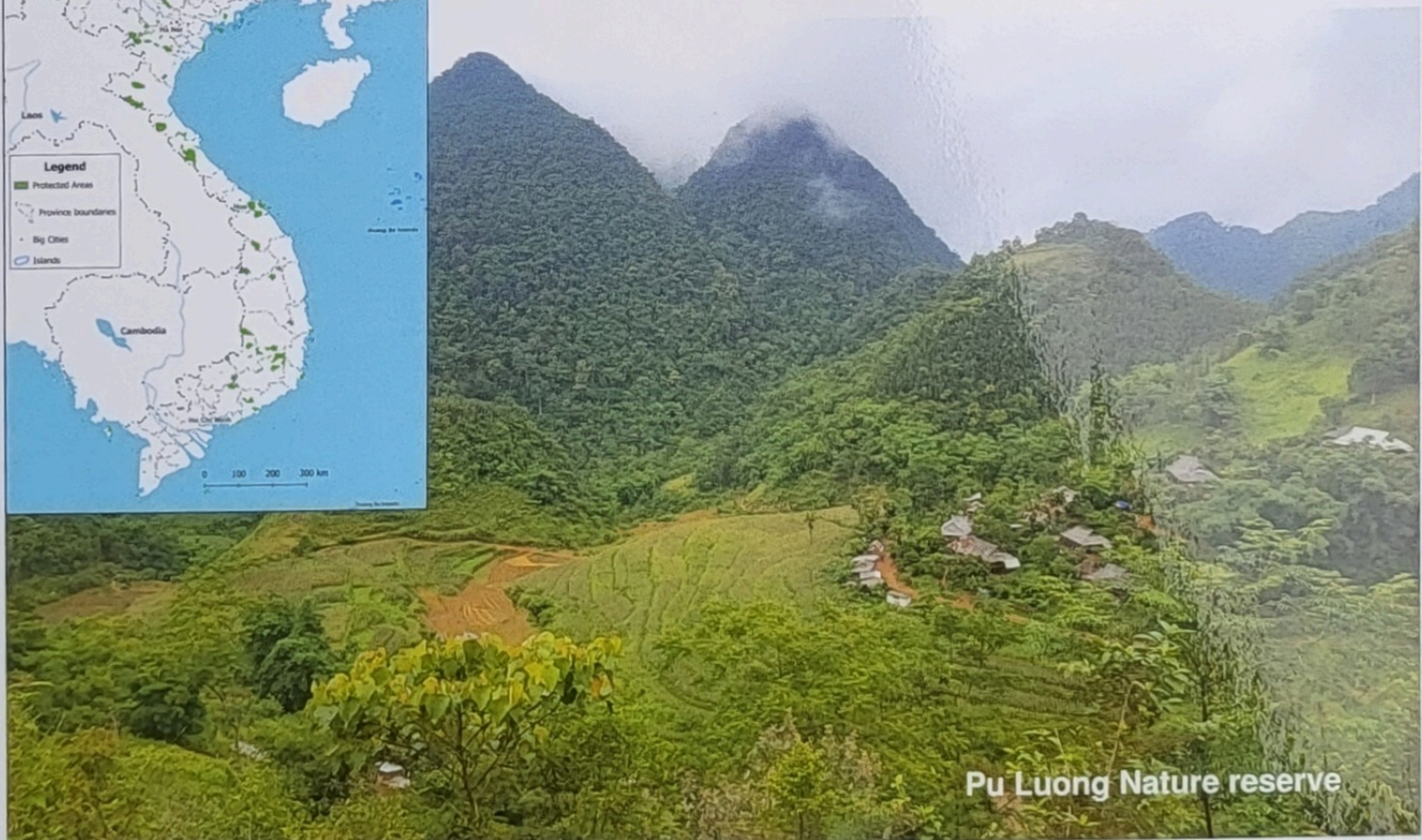
Pu Luong Nature reserve